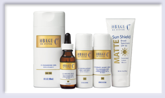
Obagi-C® Rx System