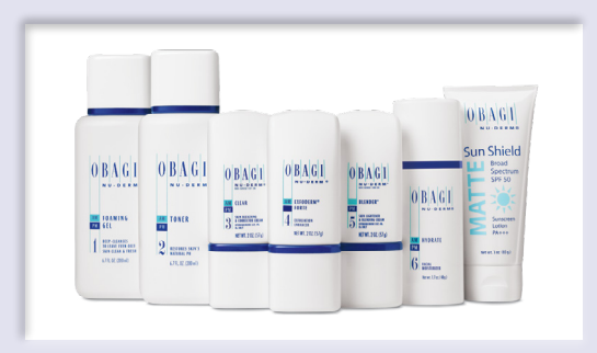
Obagi Nu-Derm® System

Prepare and complement —May complement other Obagi systems