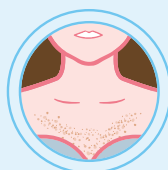
AGE SPOTS / SUN DAMAGE